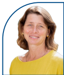
Mayor Janet Gatehouse